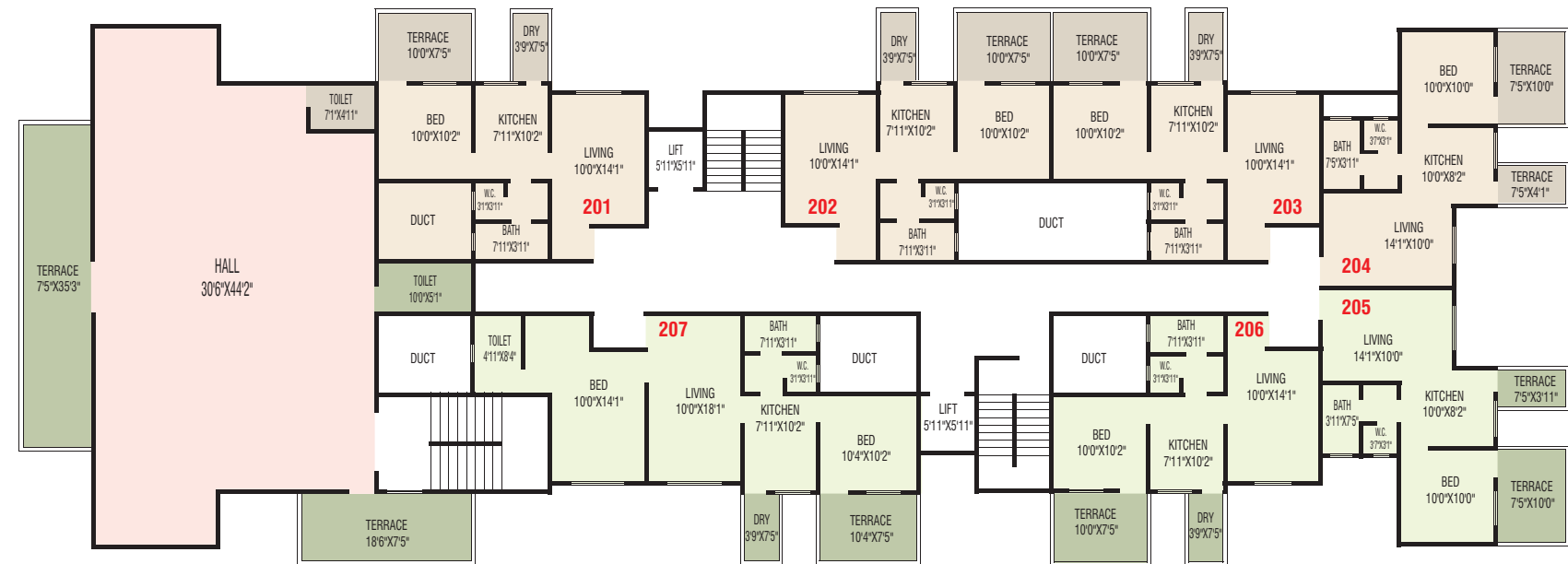
2 ND FLOOR PLAN