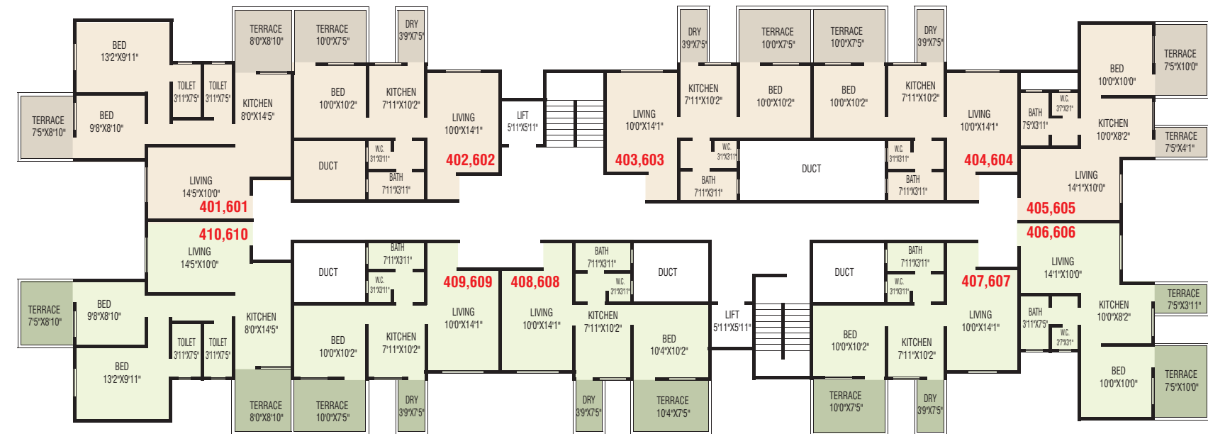
4TH & 6TH FLOOR PLAN