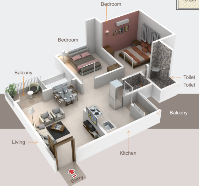
←--- 2BHK 3D View